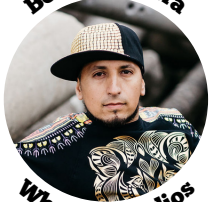
Wheel it Studios